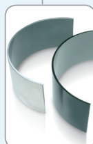
SOLGLIDE® long-life bearings