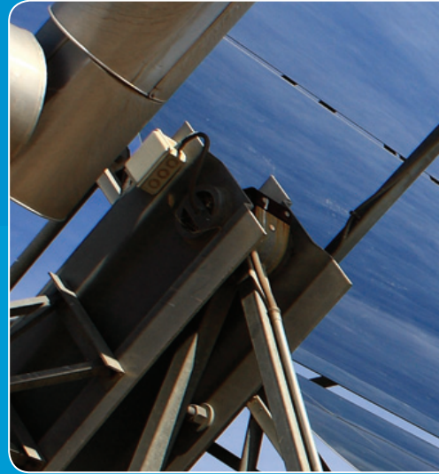
Parabolic trough application